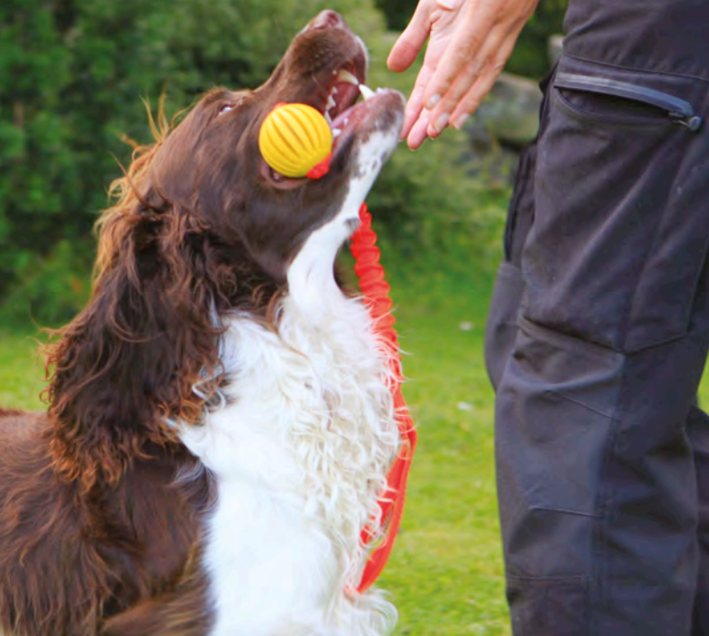
Sam has learned to follow his handler with a toy in his mouth to keep the game going.

A lot of spaniels and retrievers have a loose grip despite the fact that they love to carry things. So, we need to teach them to keep a firm hold on the dummy at all times.